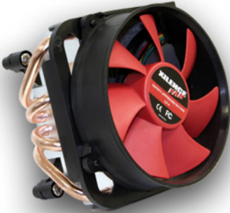
intel lga 775 heatpipe